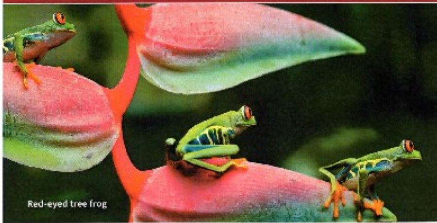
Red-eyed tree frog