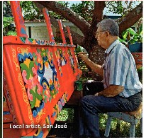
Local artist, San José